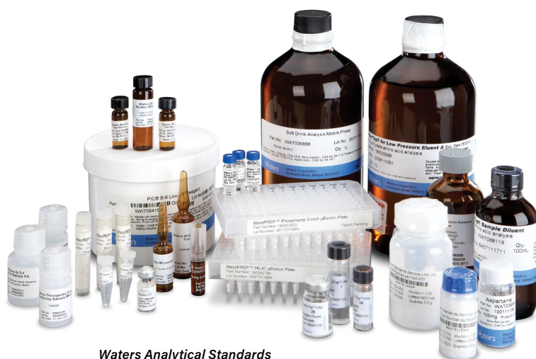
Waters Analytical Standards and Reagents.