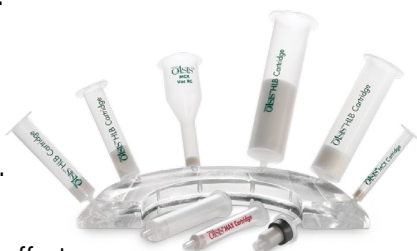
Oasis Sample Extraction Products.