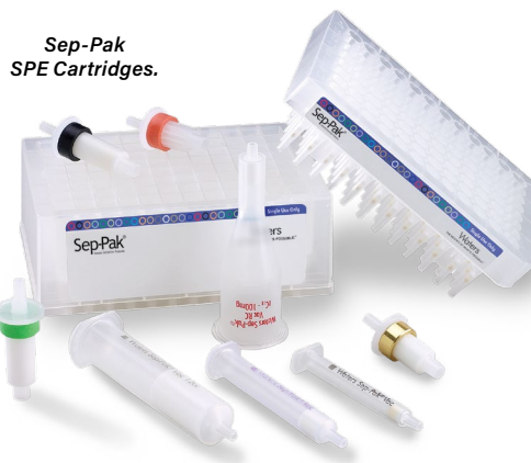
Sep-Pak SPE Cartridges.