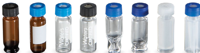
Waters Certified Vials.